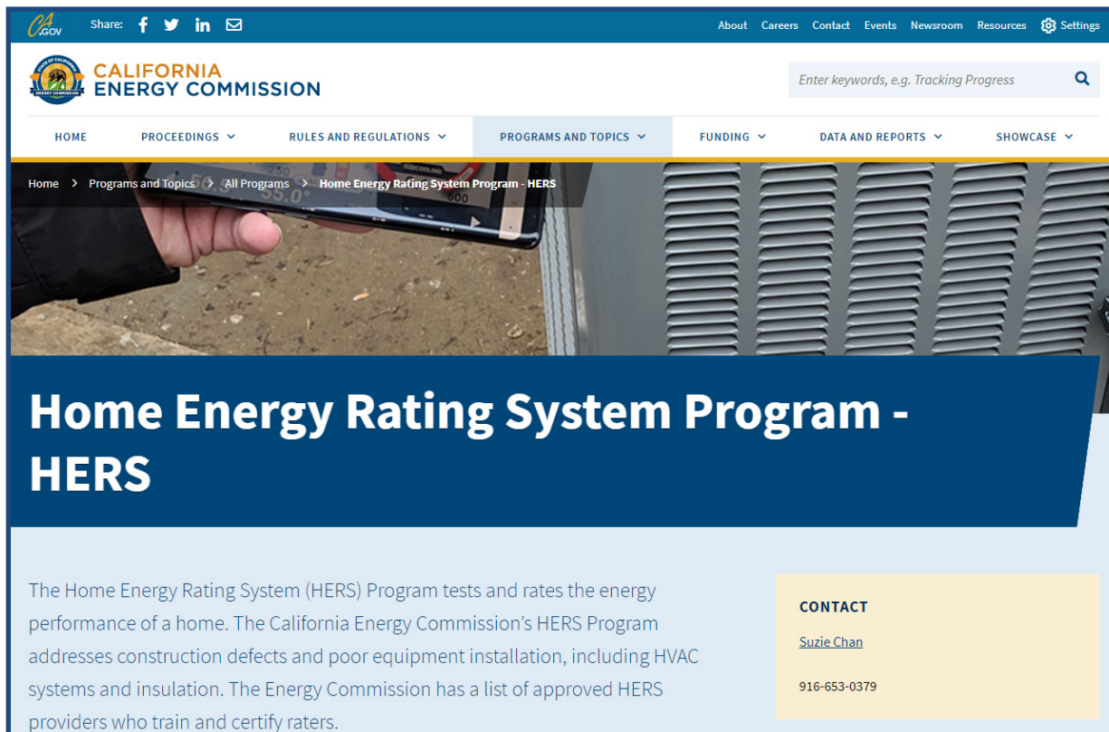
HERS Program web page

For Energy Code training in-person, online, or on-demand see Energy Code Ace's Training Schedule .