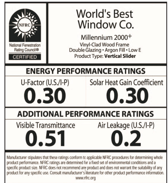
Figure 2: Sample NFRC Label

Manufacturer-generated simulated performance alternative label values should not be accepted. Manufacturer-generated values do not meet the Energy Code fenestration labeling requirements and cannot be used to verify code compliance. Please see the CEC fenestration labeling regulatory advisory , which still applies to the 2019 Energy Code.