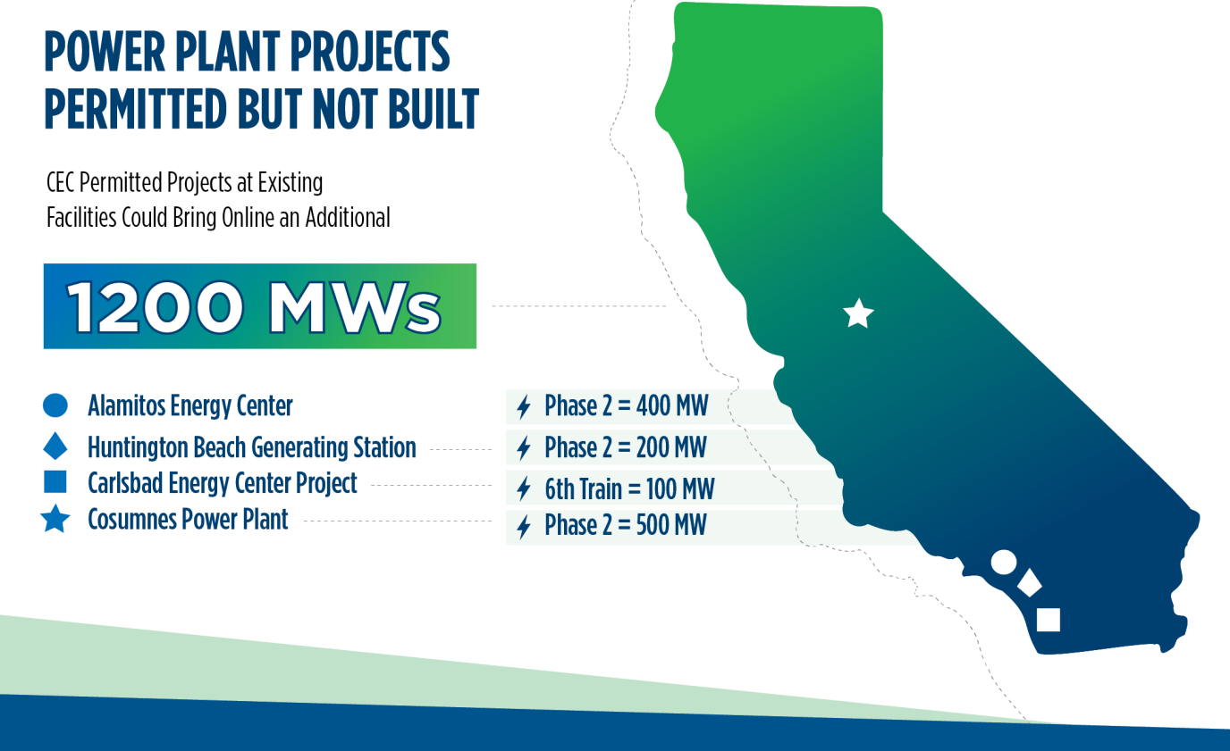
Figure 2-2: Additional Capacity Approved by CEC but Not Constructed

The Alamitos Energy Center (AES Alamitos Energy Center) was proposed as a nominal 1,040 MW, natural-gas-fired, combined-cycle and simple-cycle, air-cooled electrical generating facility consisting of two power blocks. Both blocks were approved by CEC on April 12, 2017. Block 1 is a two-on-one combined-cycle facility with a total generating capacity of 640 MW, which began commercial operation in February 2021. Block 2 was proposed as four natural gas-fired simple cycle turbines with a generating capacity of 400 MW, but it has not been constructed.