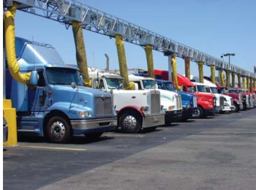
Ripon Off-board TSE Station