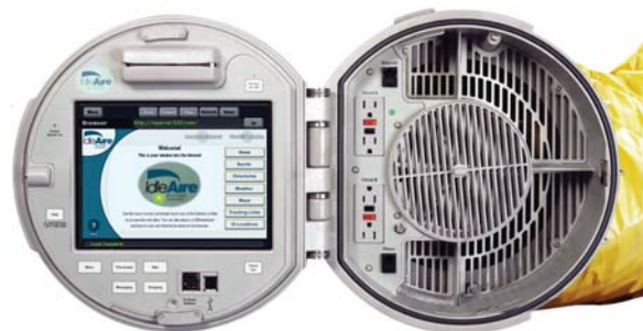
Off-board Truck Stop Electrification Station

The emerging TSE network at California truck stops feature on-board and off-board solutions. IdleAire Corporation of Knoxville, Tennessee is the developer and operator of the most popular off-board system.