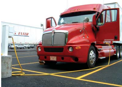
On-board TSE Service Station

Long-haul trucks that idle for long periods of time use TSE to save fuel, reduce emissions, and save engine wear and tear, and reduce driver fatigue.