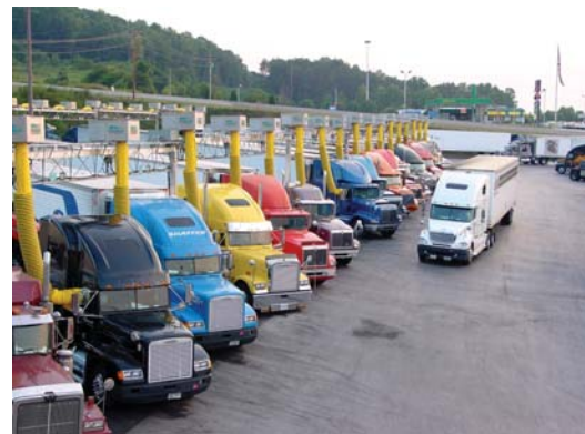
Off-board IdleAire Service Module

of diesel fuel, 5 tons of oxides of nitrogen, and 21 tons of carbon dioxide per truck annually. By 2006, the private TSE network in California has reduced emissions by over 6,000 metric tons. Since June 2003, when the first truck stops along Interstate 5 in California featured Advanced TSE, over 400,000 gallons of diesel fuel have been saved in 500,000 hours of operation.