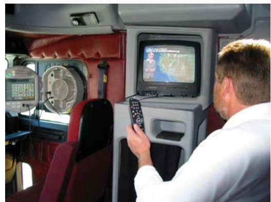
Off-board Truck Stop Electrification

TSE service providers charge truck owners $1.25/hour to $1.75/hour for the basic heating and cooling services based on different utility rates at the truck stop locations. Internet access, movies, or educational programming cost extra.