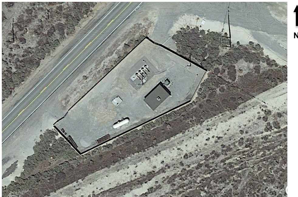
Figure 1: Existing WKWD Site

The WKWD pump station is in a rural area with the nearest sensitive residential use located 9,050 feet north-northeast from the site, and the nearest business approximately 18,350 west-northwest from the site. The existing site has been fully graded and is overlain with pea gravel. The existing site consists of various pumps, a transformer, underground vault, air bladder, and unstaffed control room. The existing site is secured by a brick fence and locking gates.