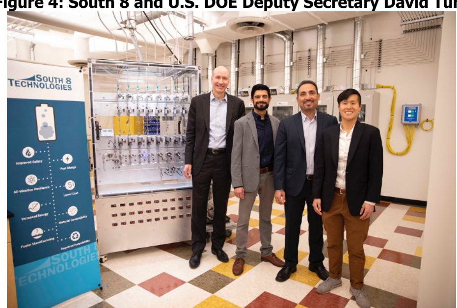
Figure 4: South 8 and U.S. DOE Deputy Secretary David Turk

35%: Increase in lithium-ion battery energy density with LiGas®.