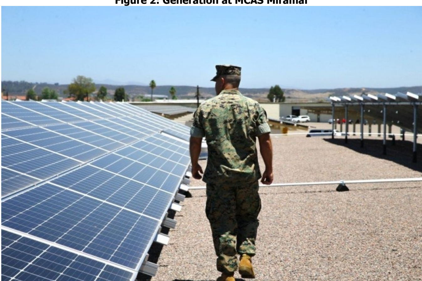
Figure 2: Generation at MCAS Miramar

Caption: A United States Marine walks by solar panels at MCAS Miramar