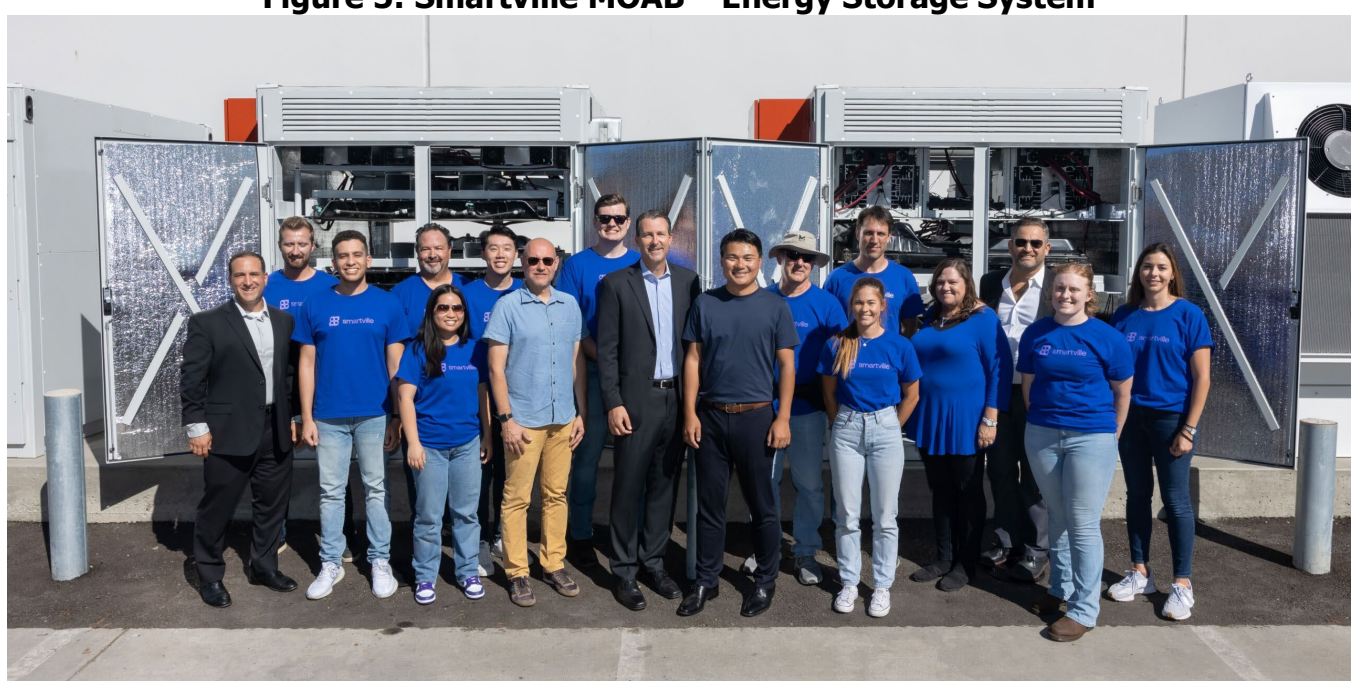
Figure 5: Smartville MOAB™ Energy Storage System

4 MWh: Total planned capacity at Wellhead Electric, a San Joaquin Peaker Plant.