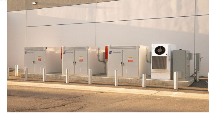
Smartville's Pilot ESS Demonstration System