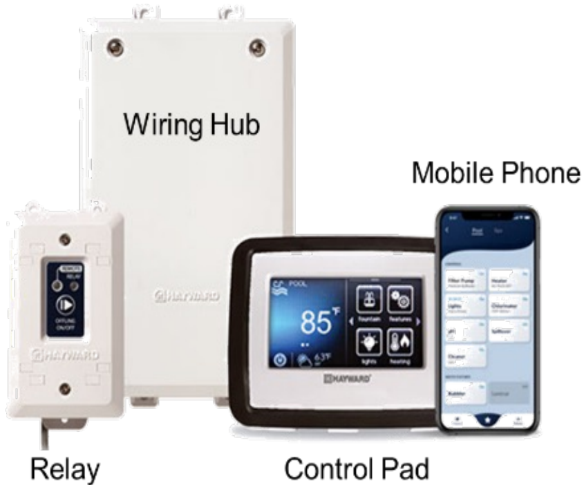
Equipment in Separate Enclosures