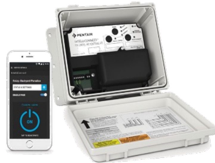
Equipment in Single Enclosure