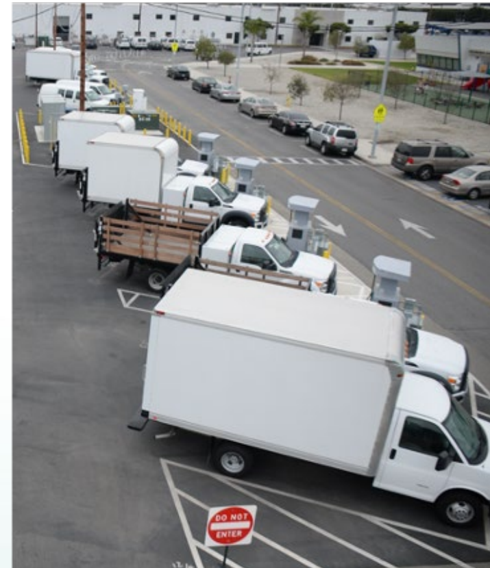
LAAFB: Medium-Duty EVs.

Source: Lawrence Berkeley National Laboratory