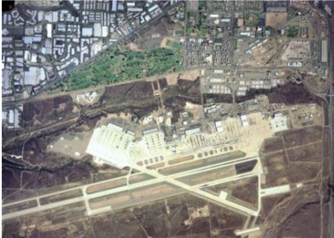
Miramar Marine Corps Air Station