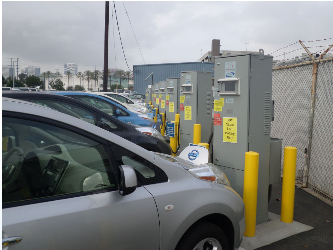
LAAFB: Light-Duty EVs.

Source: Lawrence Berkeley National Laboratory