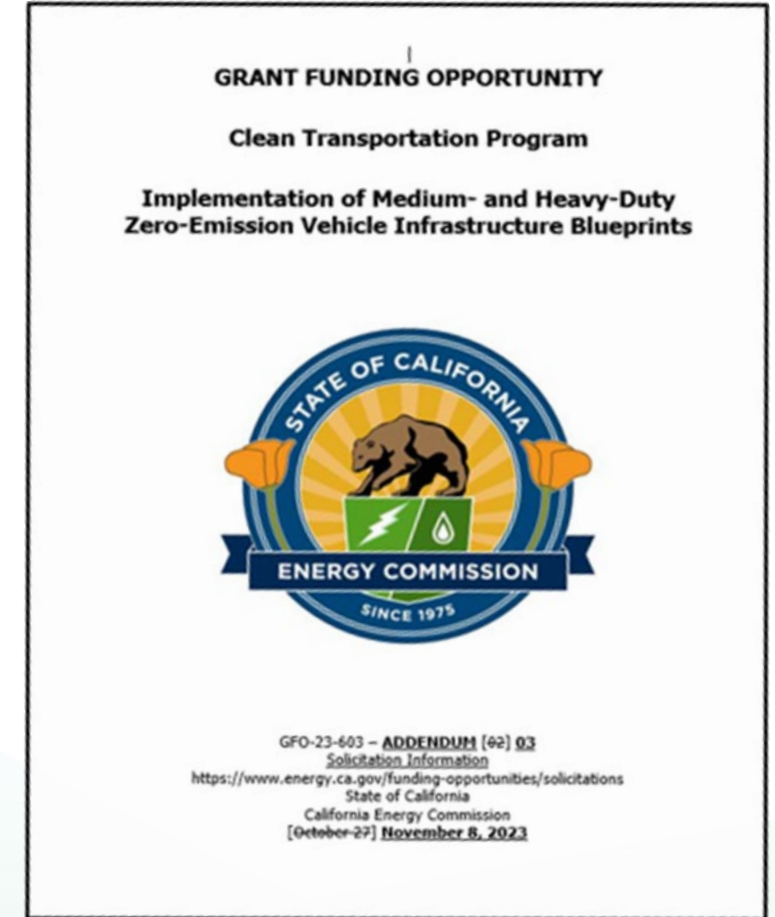
GFO-23-603 Solicitation Source: CEC