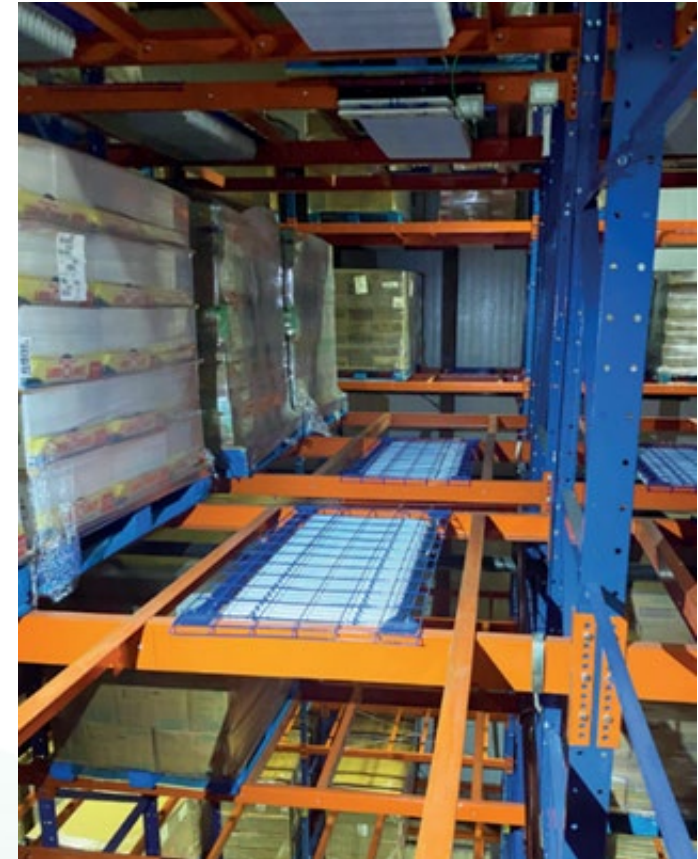
Phase Change Material in a rack