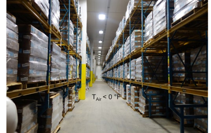
Photo of a freezer room