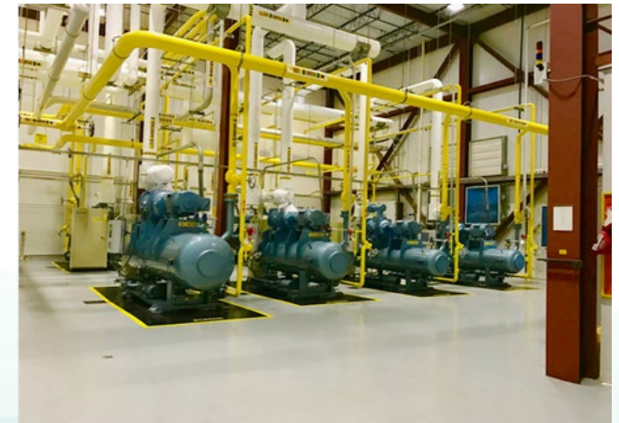
Photo of screw compressors