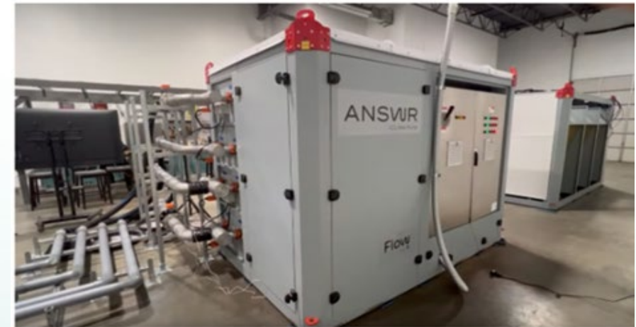
Photo of Flow's Laboratory Testbed