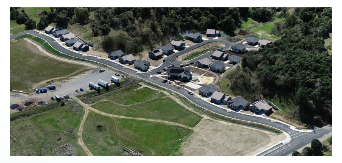
Bi'du Khaale Housing Community

20 Level 2 charger ports (10 w/solar integrated storage)