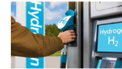
Hydrogen Refueling Stations in California

Explore how many new zero emission vehicle are registered.