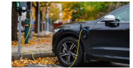
Electric Vehicle Chargers in California

Explore how many hydrogen refueling stations are available in California.