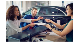
New ZEV Sales in California

Access the most showcased tools below. Search for more Data Exploration Tools