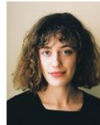
Chelsea Kirk *

OC Goes Solar June 12, 2024 - March 31, 2025