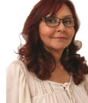
Gem Moon Montes*

People's Collective for Environmental Justice May 8, 2025 – March 31, 2027