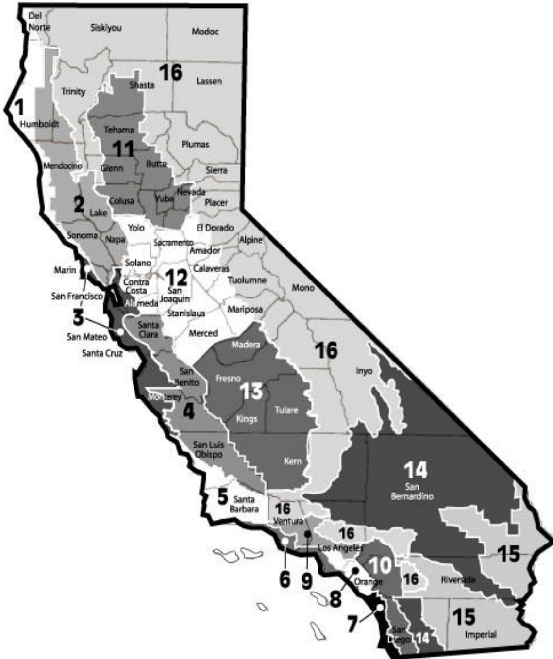
Figure 1-1: California Climate Zones

designed to the requirements of the climate zone in which 50 percent or more of the building is contained.