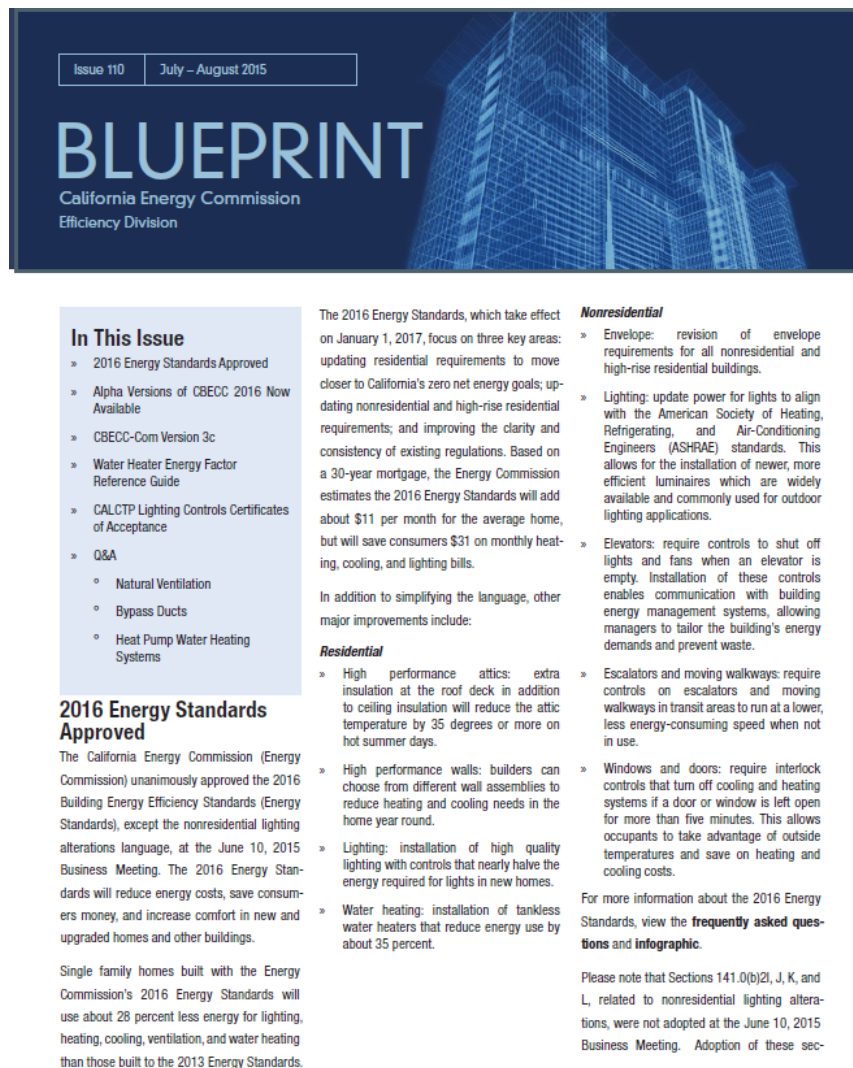
Figure 1-3: Energy Commission Blueprint Newsletter