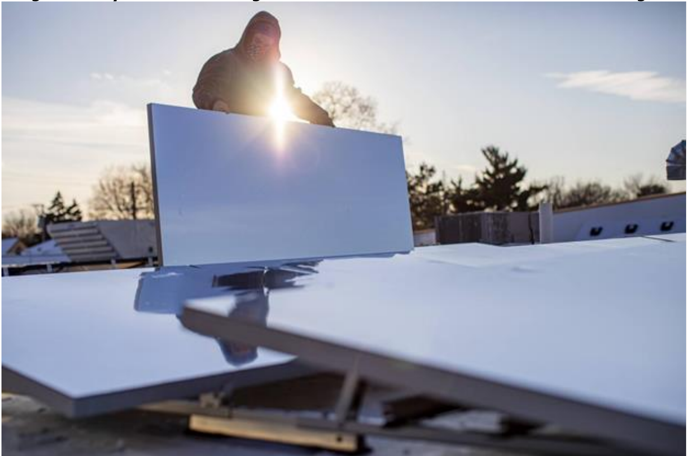
Figure 3: SkyCool Panels Being Mounted with Conventional Solar Panel Racking

0: Refrigerants with global warming potential used in SkyCool Panels