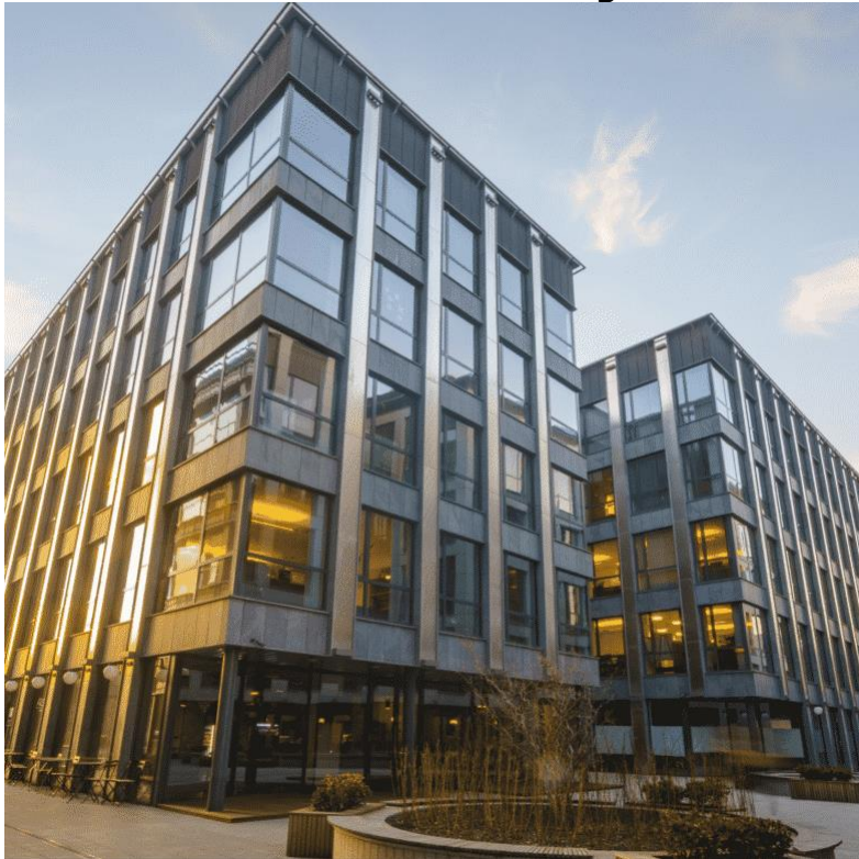
Figure 2: Ubiquitous Energy's Transparent PV Window Coating Installed on a Commercial Building

2000: The number of 14x20-inch solar windows Ubiquitous Energy seeks to produce per year by the end of their current CEC project in 2024