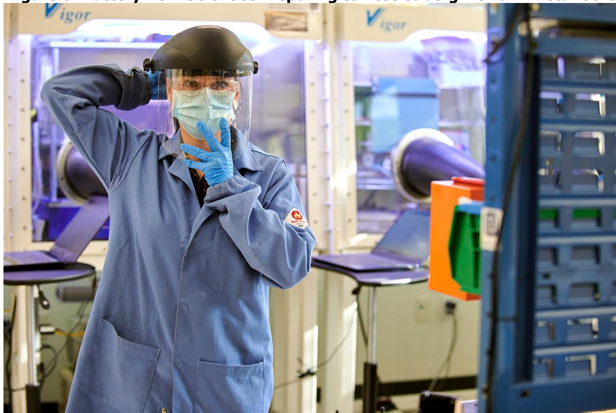
Figure 6: Battery R&D Scientist Preparing to Test Cuberg Lithium-Metal Cells