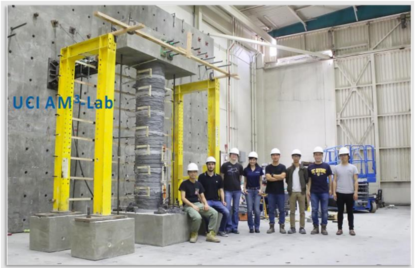
Figure 4: UC Irvine Team with the 3DCP Tower Assembly

<1 day: the amount of time RCAM is targeting for on-site fabrication of a new tower