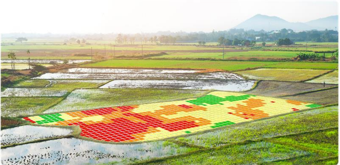
Figure 5: AgMonitor Platform Display

3 MW: permanent load shift as of August 2021 provided by California agricultural irrigation pumps intelligently controlled with AgMonitor, supporting grid reliability