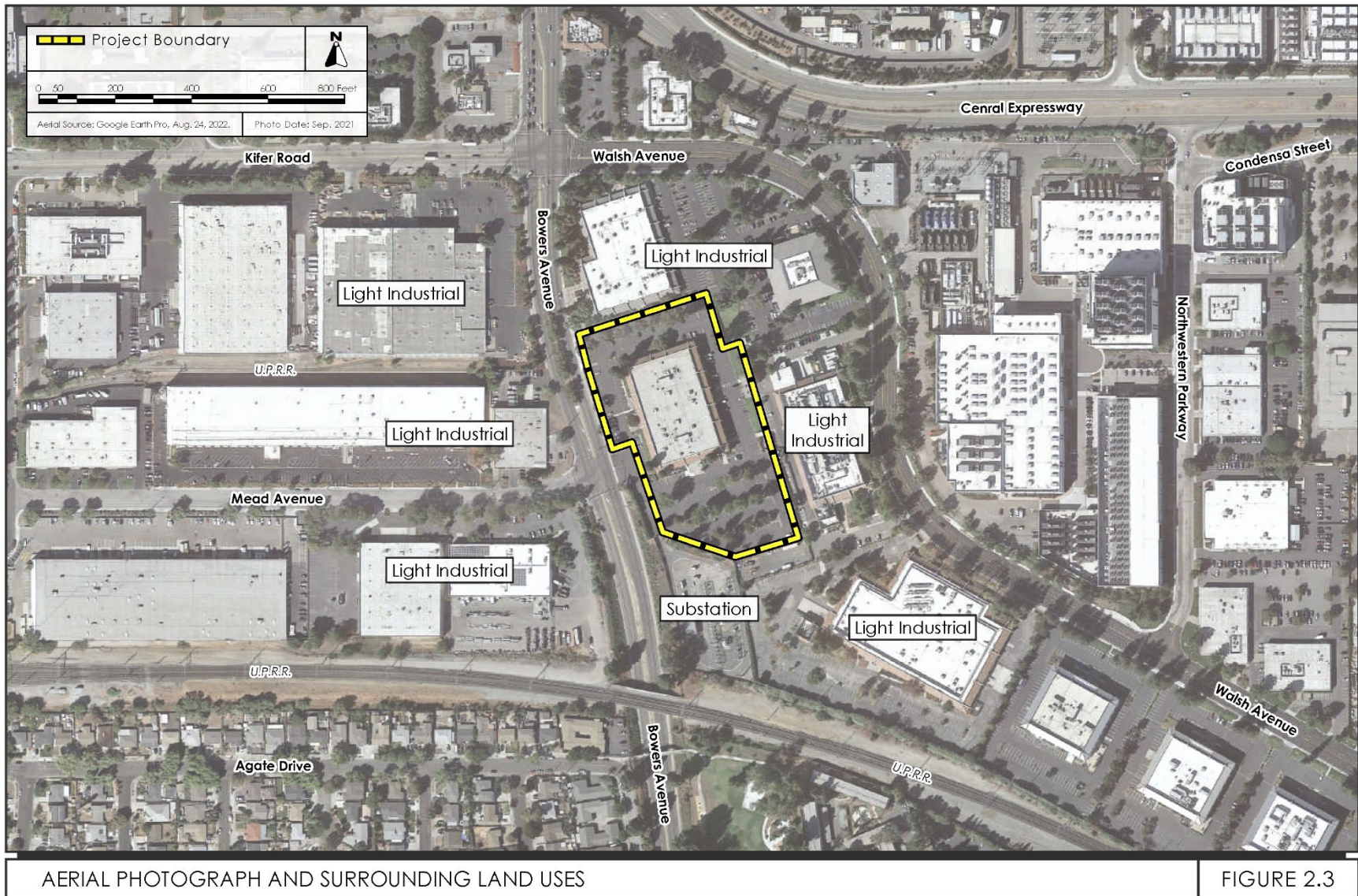
Figure 2.2-3 Aerial Photograph and Surrounding Land Uses