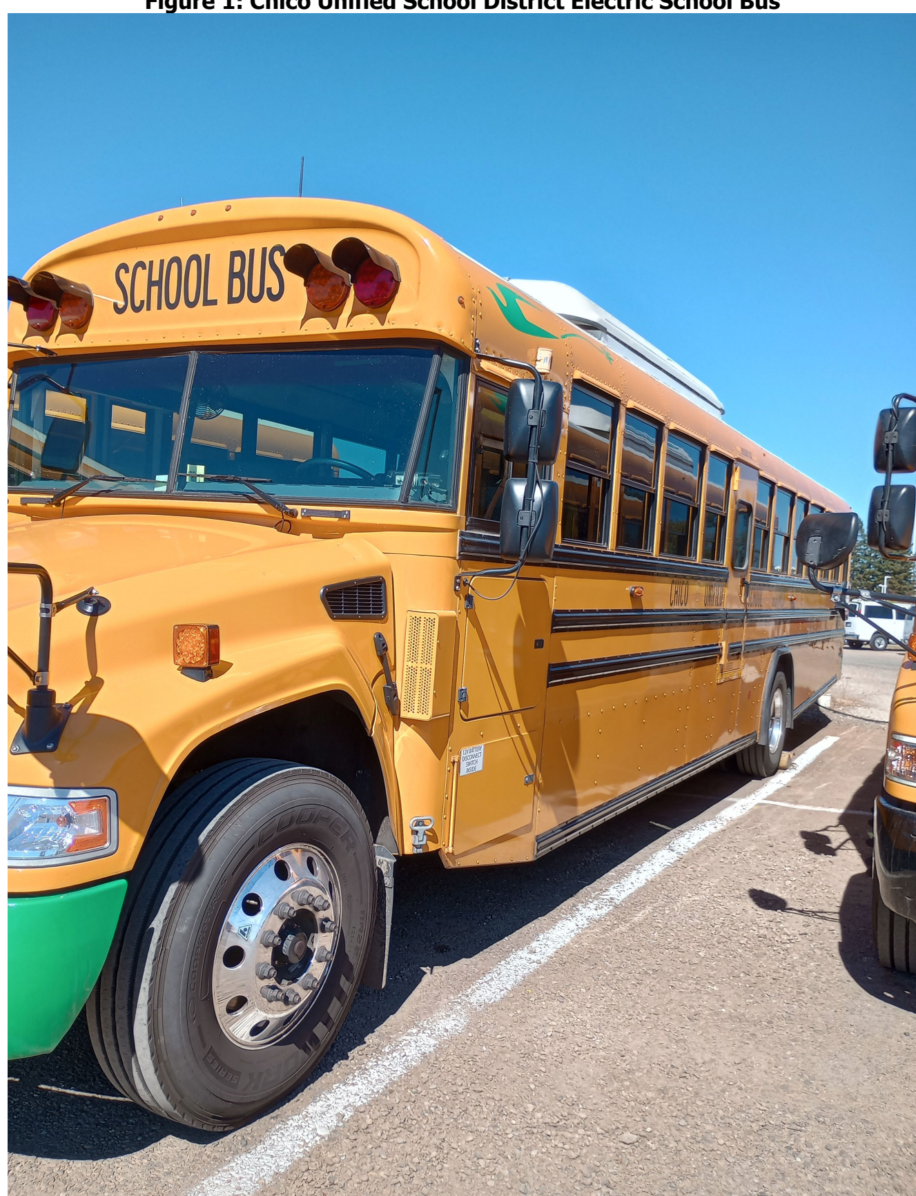
Figure 1: Chico Unified School District Electric School Bus