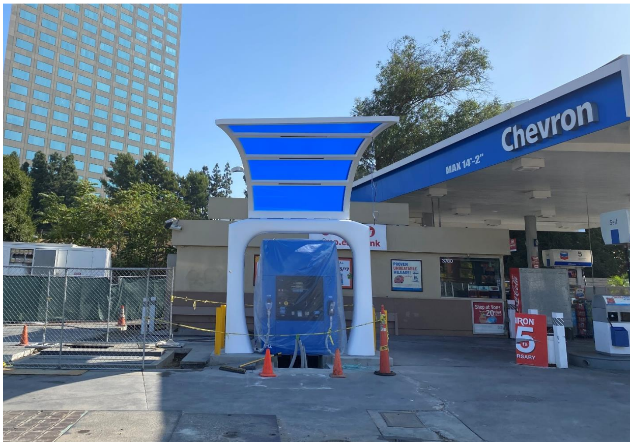
Figure 8: Tatsuno Dispenser Progress at the Studio City Station