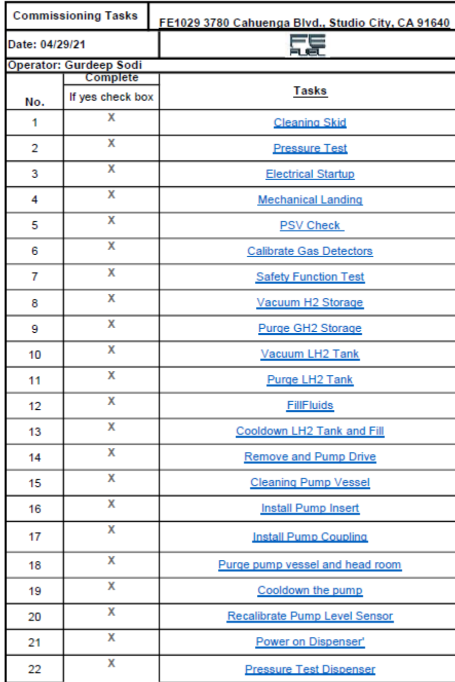
Table 1: Commissioning Checklist