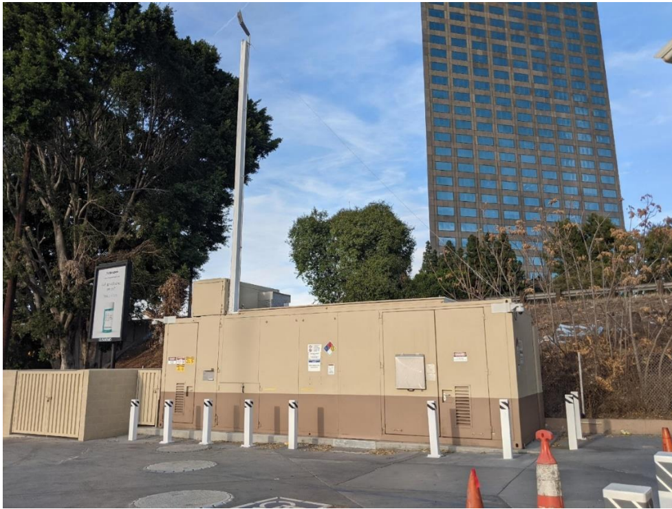
Figure 4: Linde Unit (Compressing and Dispensing Equipment)