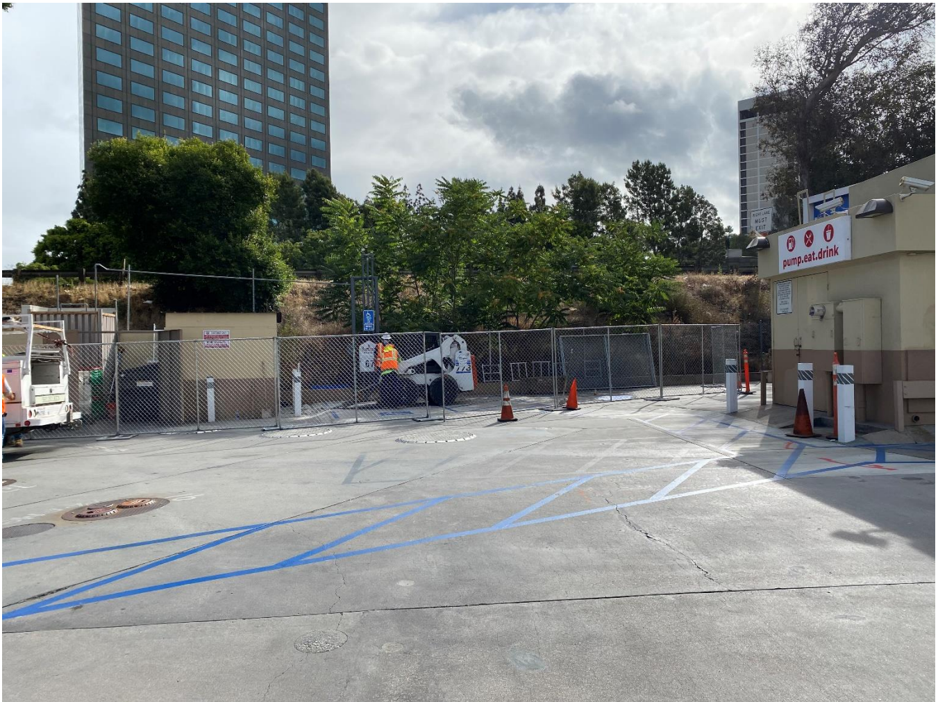
Figure 6: Breaking Ground at the Studio City Station

On June 29, 2020; the construction team broke ground and started work addressing existing site conditions and relocating equipment necessary for gas station operations. Shortly thereafter, the construction team proceeded with demolition, formwork laying initial conduit connections, and pouring concrete for our equipment pads that serve as the base of our Linde compressing and FIBA storage units.