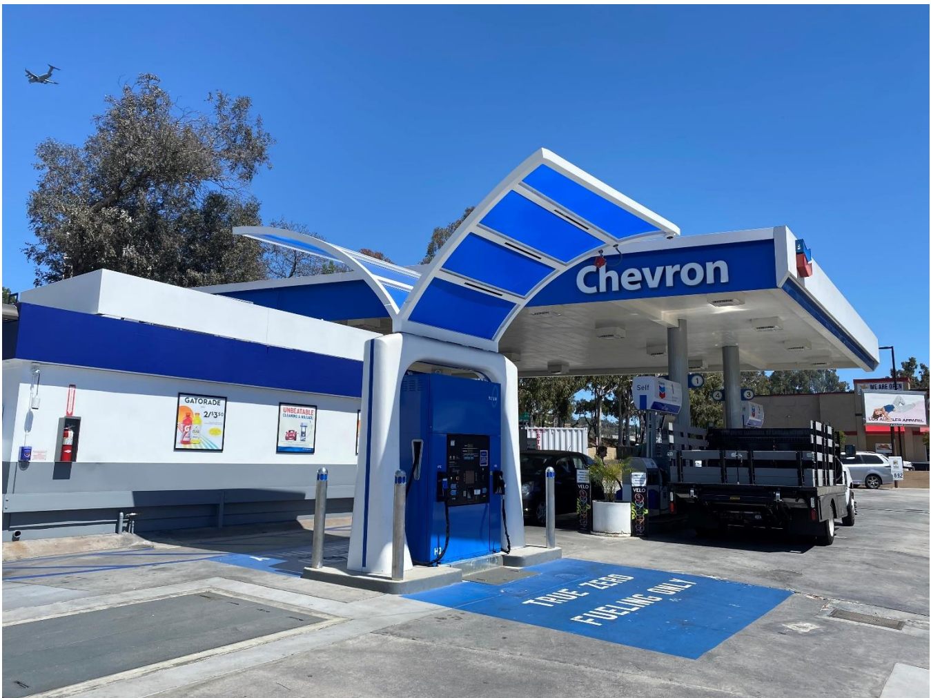
Figure 12: Completed Studio City Hydrogen Station

The Studio City hydrogen station is the seventh liquid hydrogen station that FEF has opened which has a fueling capacity of more than 808 kilograms per day. This larger fueling capacity plays a pivotal role in the infrastructure needs of today, serving the greater number of FCEVs on the road. Additionally, with two fueling positions, FEF is able improve the customer experience and reduce that amount of time waiting for an open pump.