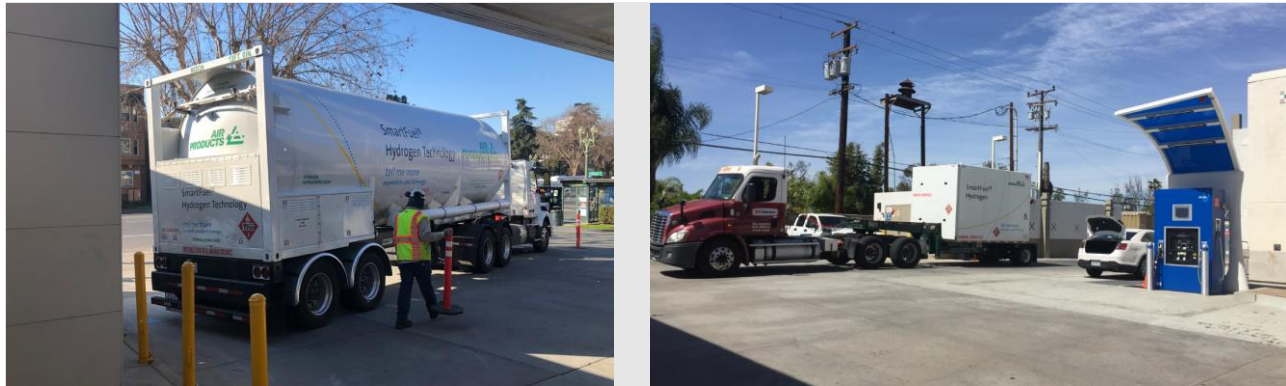
Figure 1: Liquid Hydrogen and Gaseous Hydrogen Delivery Trucks

Liquid hydrogen truck can deliver 2,400kg (left) compared to 120 kg for gaseous hydrogen truck (right)