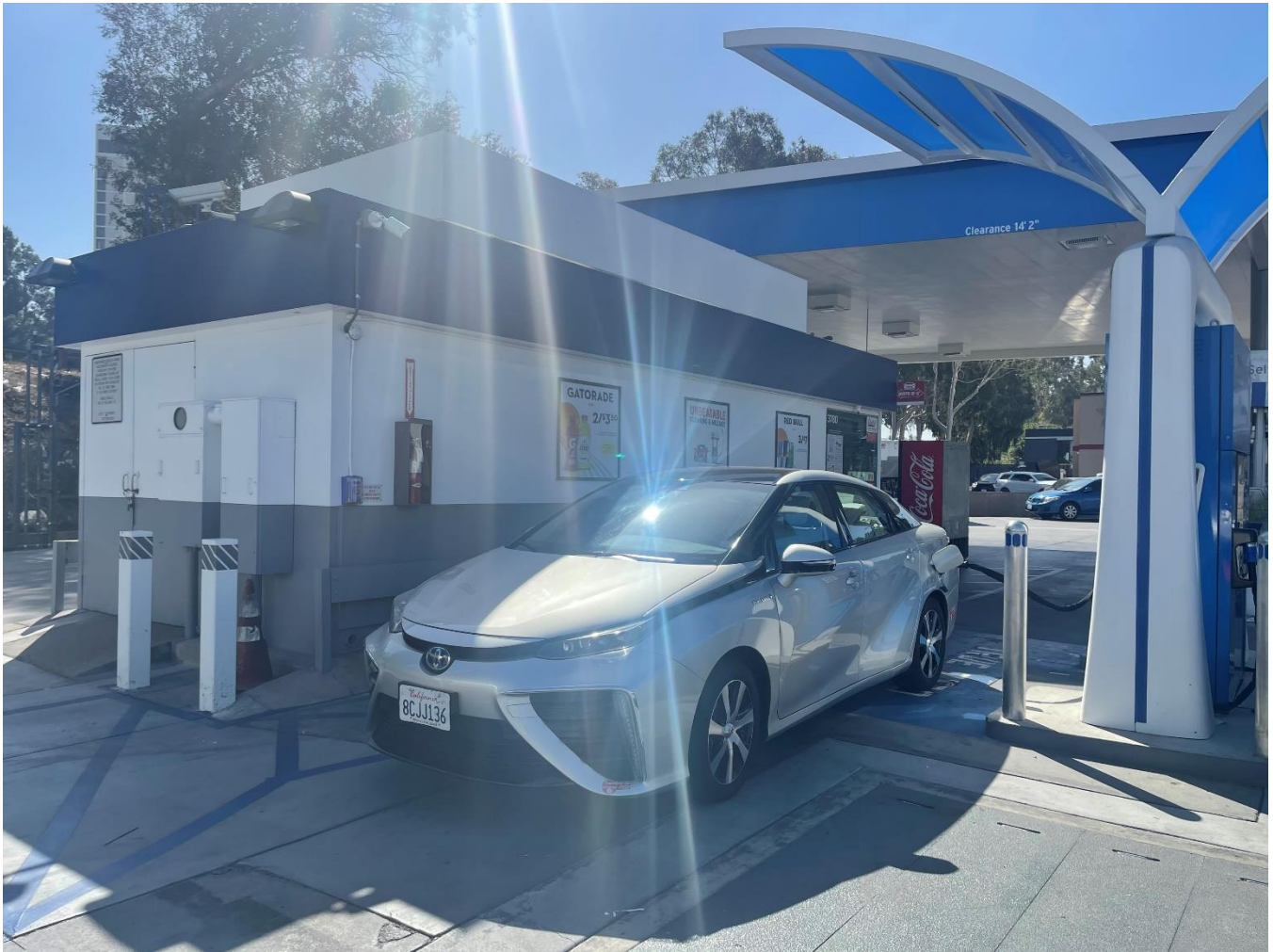
Figure 11: Customer Fueling at the Studio City Station