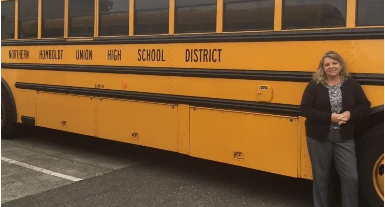
Figure 8: Northern Humboldt Unified School District Renewable Diesel-Powered Bus