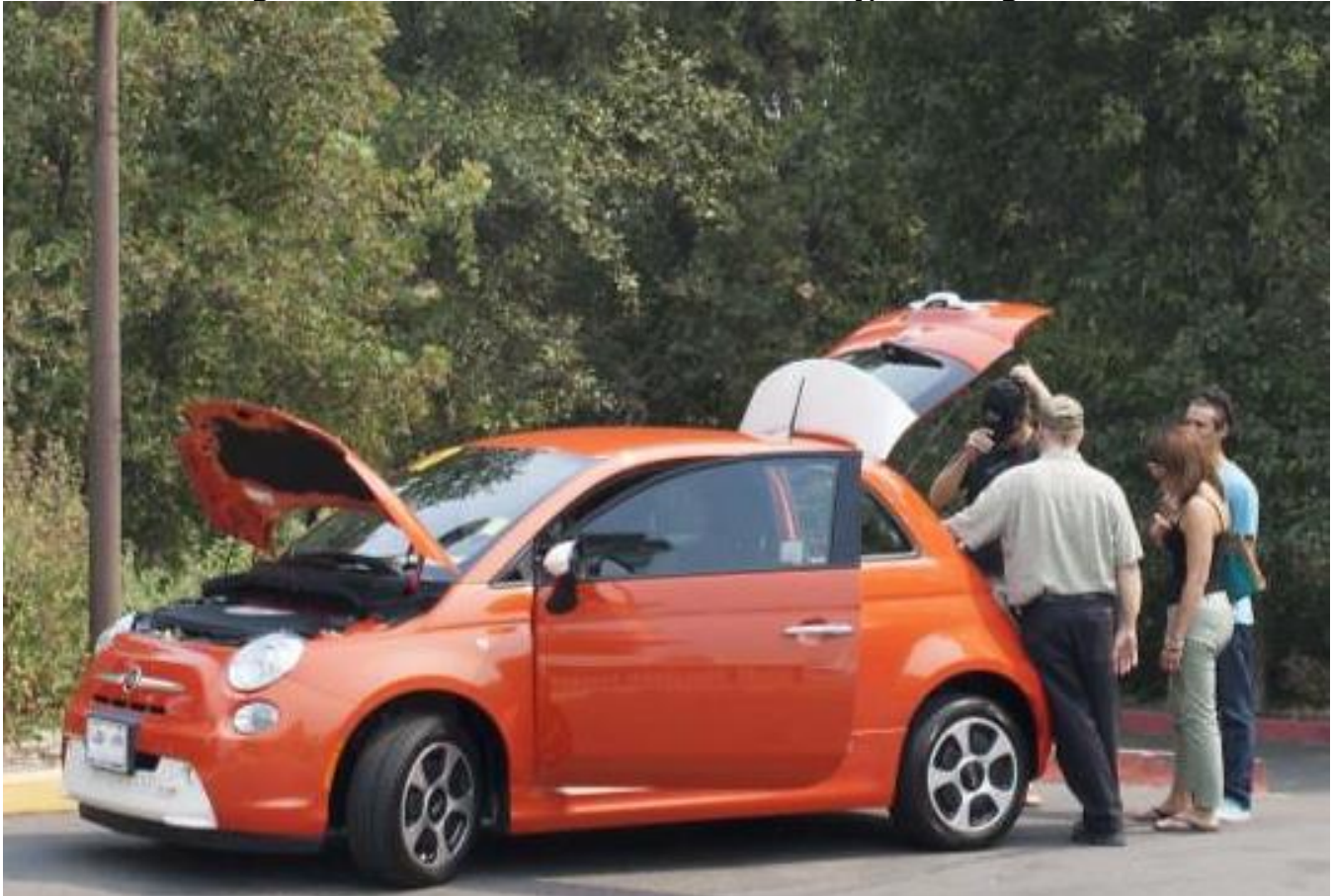
Figure 1: EV Ride and Drive at Turtle Bay, Redding 2017

Interested buyers learn about the features of a Fiat 500e from local dealer.