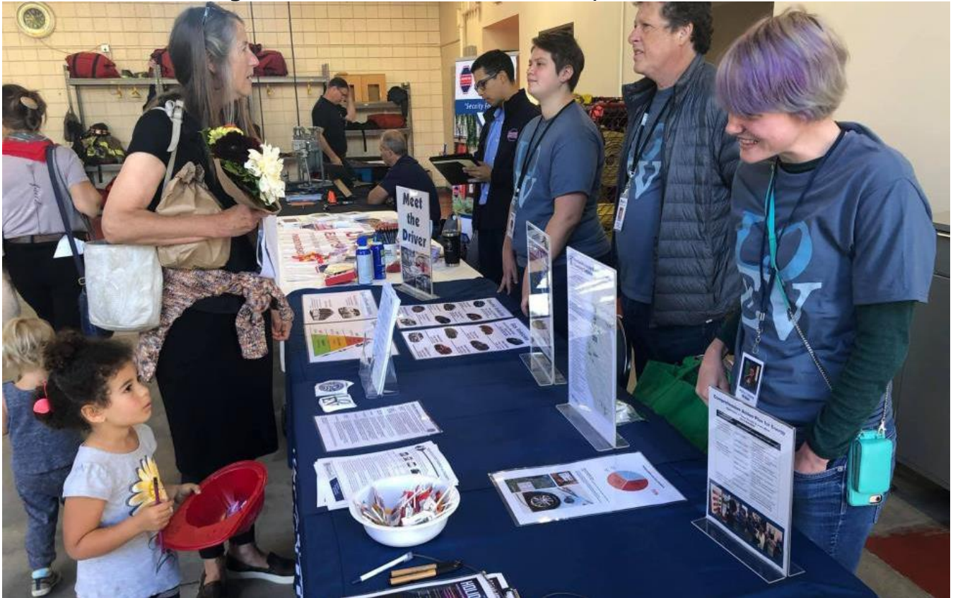
Figure 6: Meet the Driver Seminar, Arcata 2019