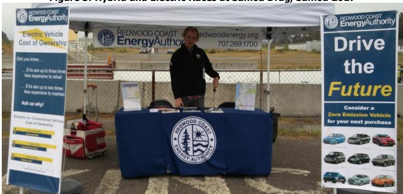
Figure 3: Hybrid and Electric Races at Samoa Drag, Samoa 2017

Upcoming community events are shown in the map depicted in Figure 4, as well as listed in Table 2.