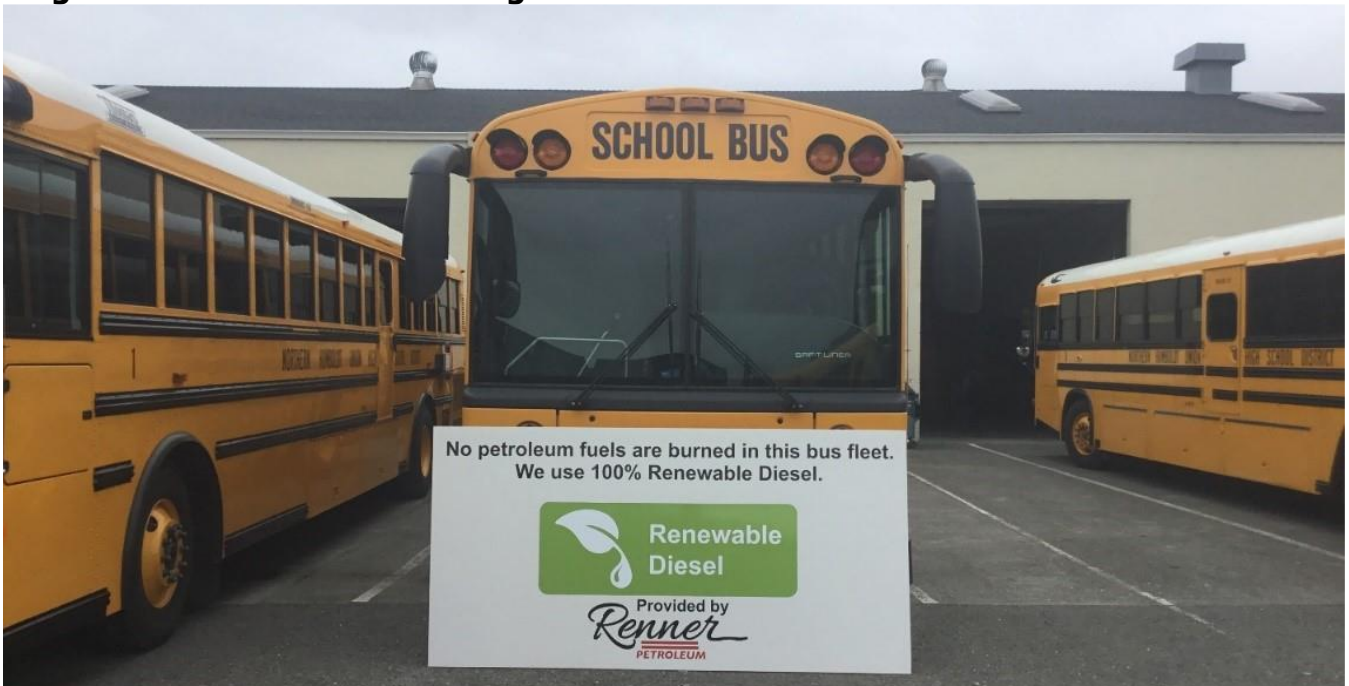
Figure 9: Renner Petroleum Sign in Front of Humboldt Unified School District Bus