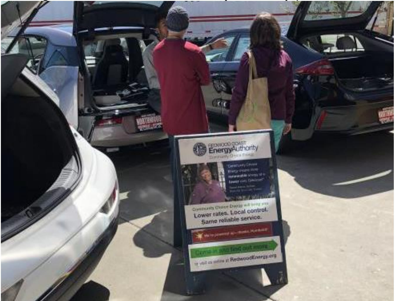
Figure 2: Eureka Natural Foods Earth Day 2018 EV Expo, Eureka 2018