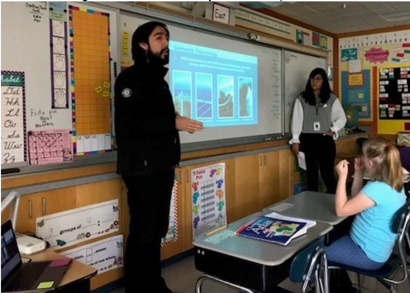
Figure 7: Arcata Elementary Presentation, Arcata 2018