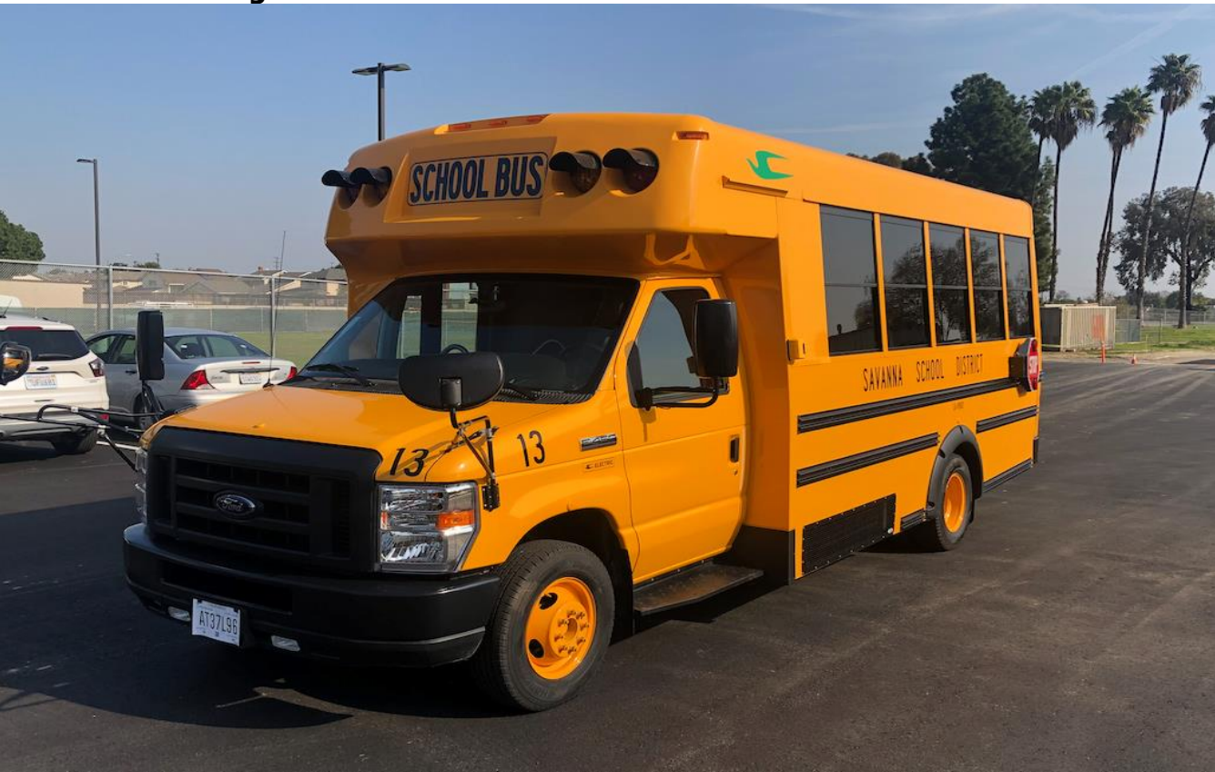
Figure 1: Savanna School District Electric School Bus