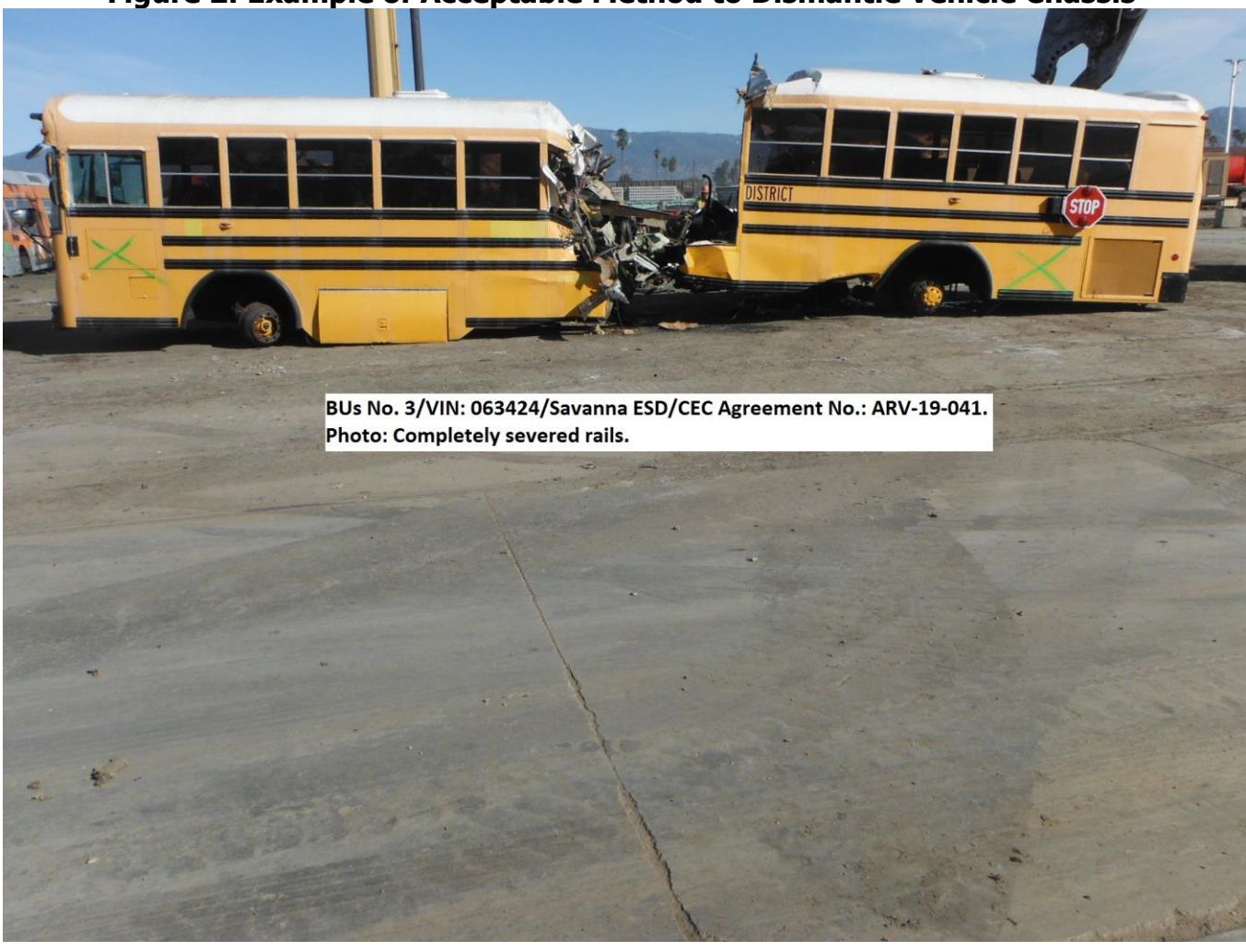
Figure 2: Example of Acceptable Method to Dismantle Vehicle Chassis