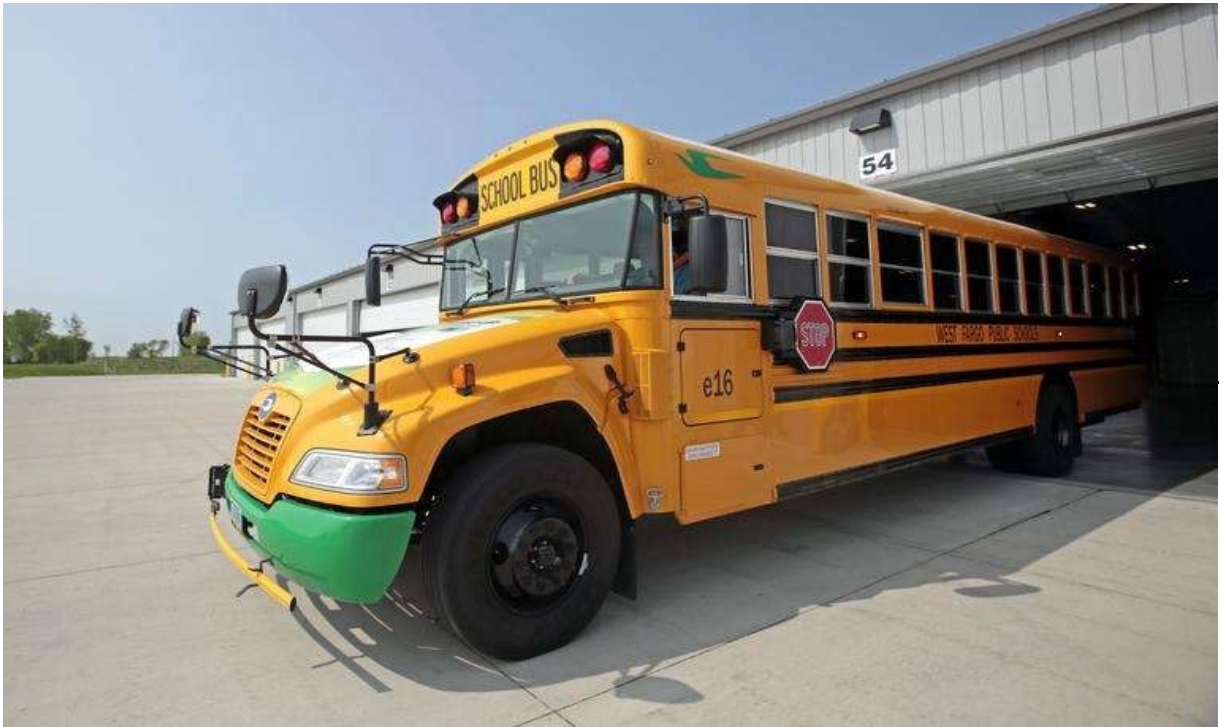
Figure 7: Electric Replacement Bus Number 44