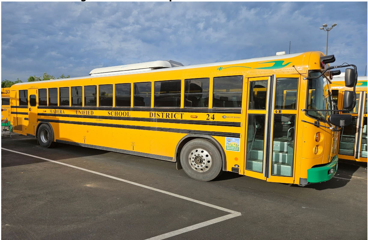
Figure 4: Electric Replacement Bus Number 24