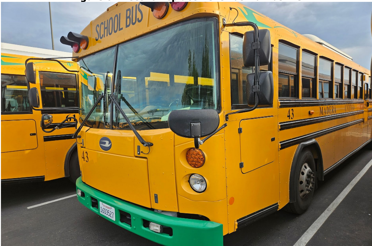
Figure 6: Electric Replacement Bus Number 43