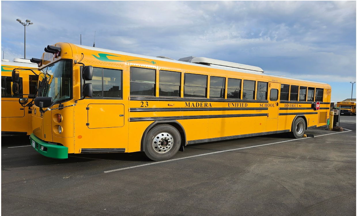
Figure 3: Electric Replacement Bus Number 23