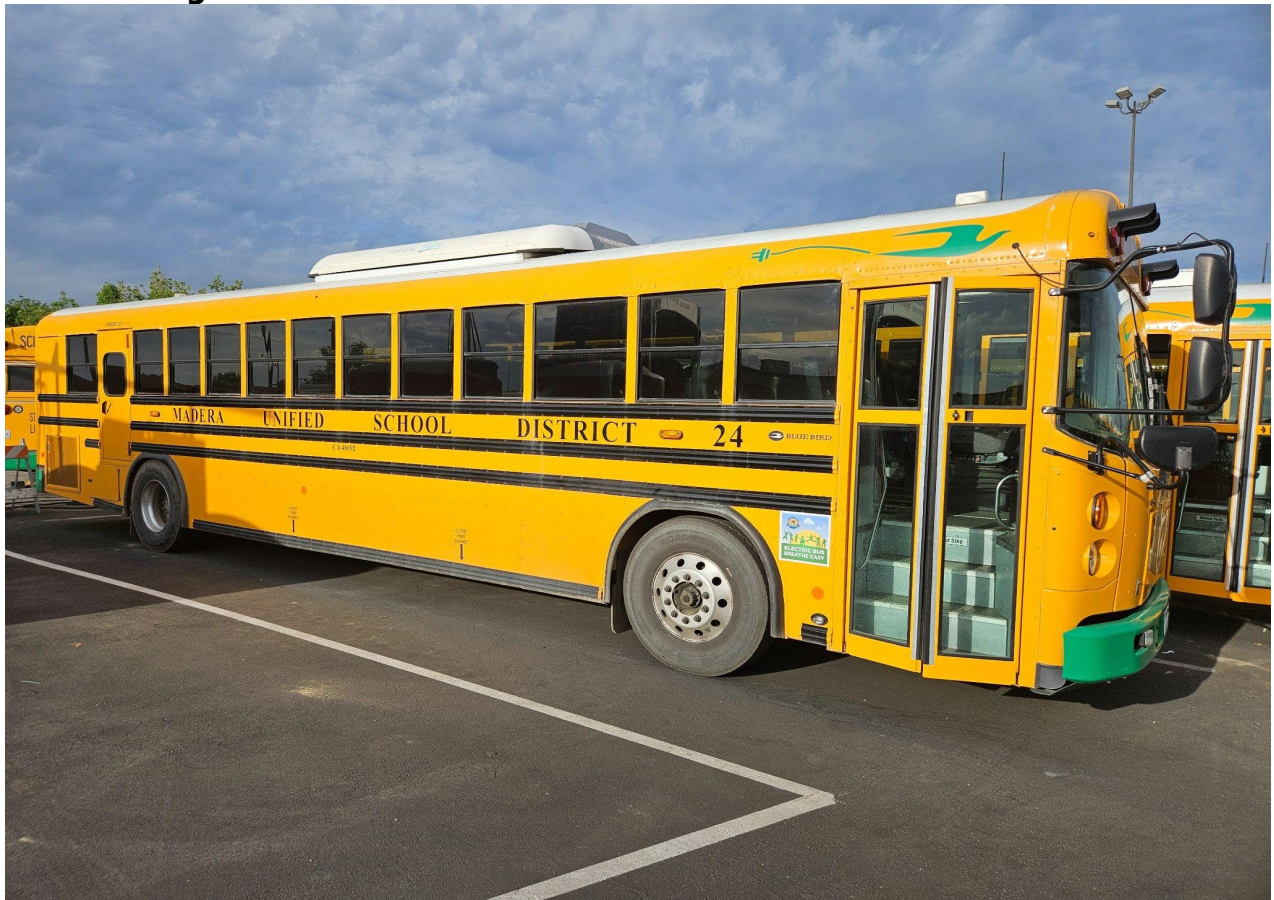
Figure 1: Madera Unified School District Electric School Bus