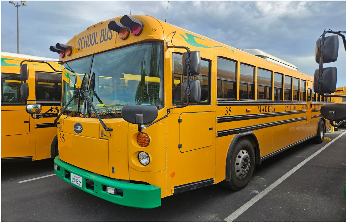
Figure 5: Electric Replacement Bus Number 35