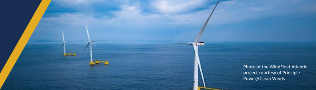
Photo of the WindFloat Atlantic project

June 2023 | Virtual (Zoom) and In-Person