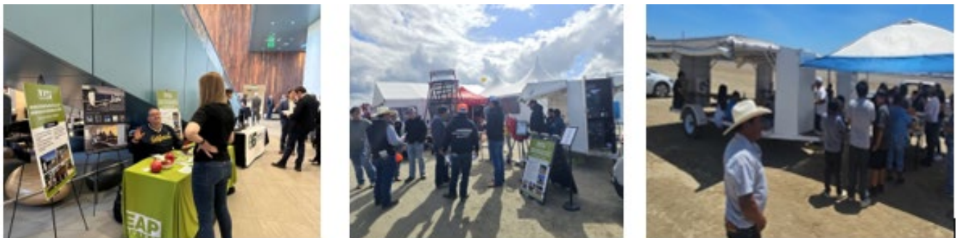
Figure 7: Intelli-Trailer Community Engagement

LEAP showcased operational MORBUG Intelli-trailer units at Earth Day celebrations, community gatherings, farmworker events, cultural festivals, Halloween and Trunk-or-Treat events, farmers markets, community PSPS-preparedness workshops, and fire-safety days. Each demonstration allowed residents to interact directly with the system, test the power output, use Wi-Fi, experience the shaded rest area, and provide feedback on potential design improvements.