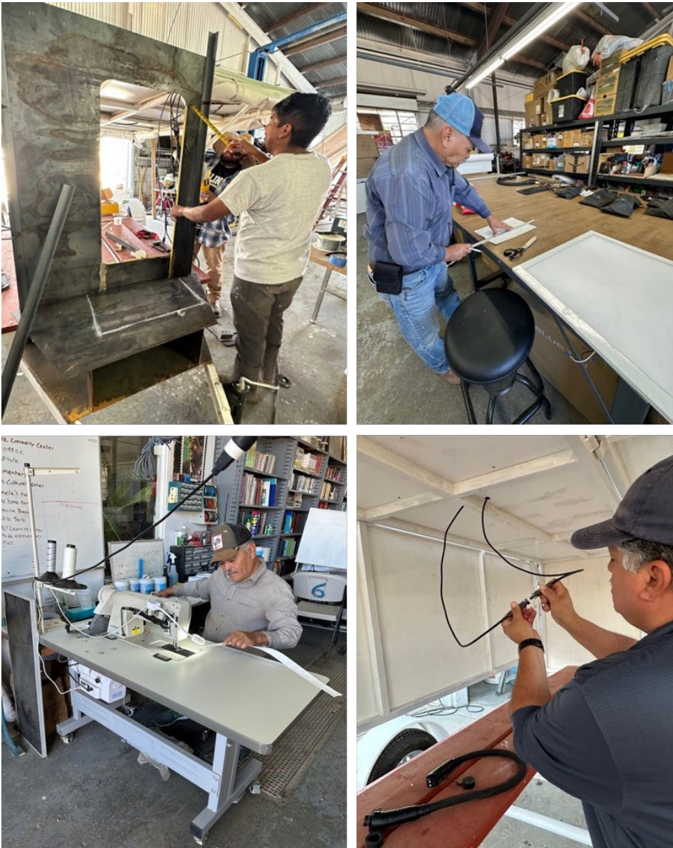
Figure 4: Intelli-Trailer Fabrication and Assembly in Huron, California

Images of the LEAP team performing fabrication and assembly are shown in Figure 4.