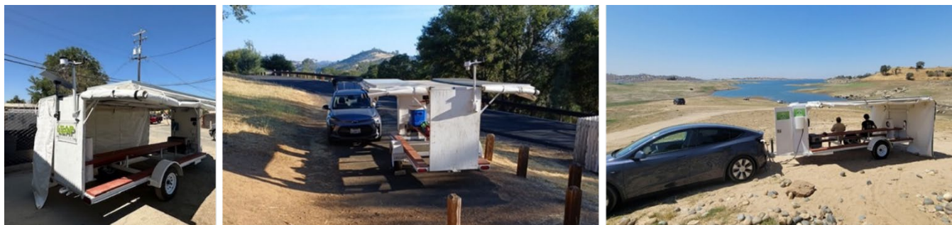
Figure 6: Field Testing of the Intelli-Trailer in Diverse California Climates

Further southeast, the Paradise Cove site is located in the rugged mountain basin surrounding Lake Isabella. On the map, this location is found within the southern extent of the Sierra Nevada range, transitioning toward the Mojave Desert. The region features steep canyon roads, high elevation, sparse vegetation, and intense solar exposure. This geography provided an ideal environment for stress-testing MORBUG Intelli-trailer performance under cold nights, dry air, and high-UV daytime conditions typical of California’s interior mountain-desert interface.