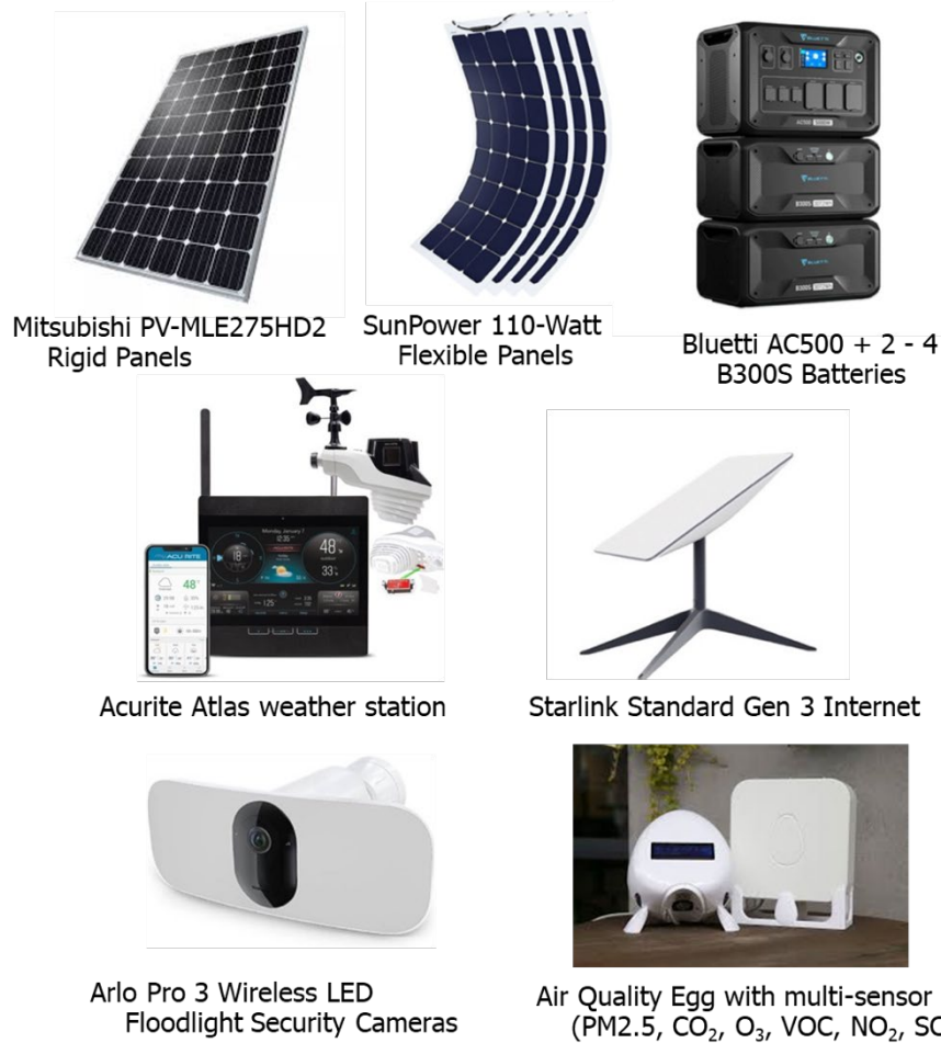
Figure 2: LEAP Intelli-Trailer Components