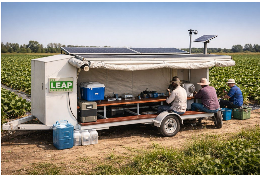
Figure 1: LEAP MORBUG Intelli-Trailer