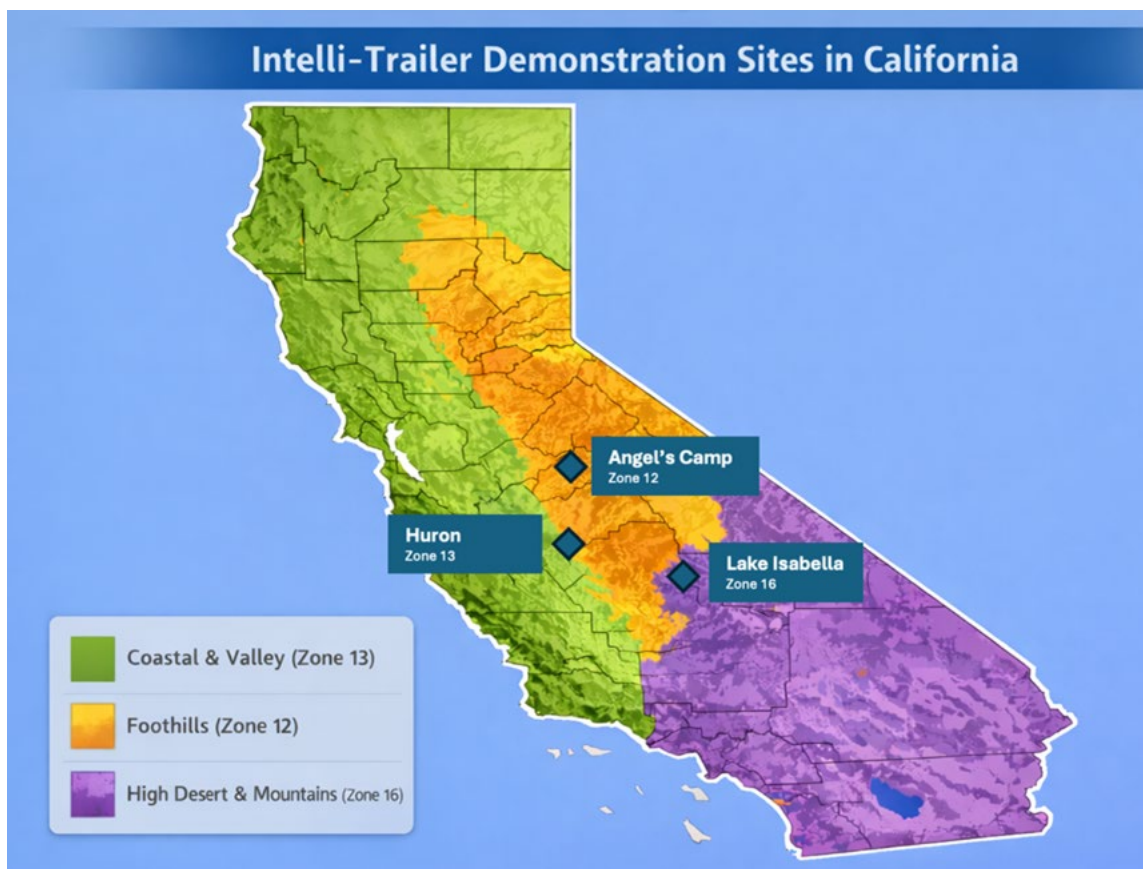
Figure 5: LEAP Intelli-Trailer Demonstration Sites