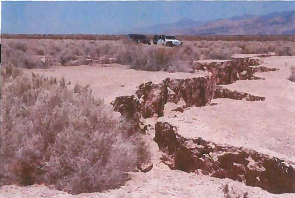
Figure 2. Large ground cracks located approximately 4 miles north of the HHSEGS site.